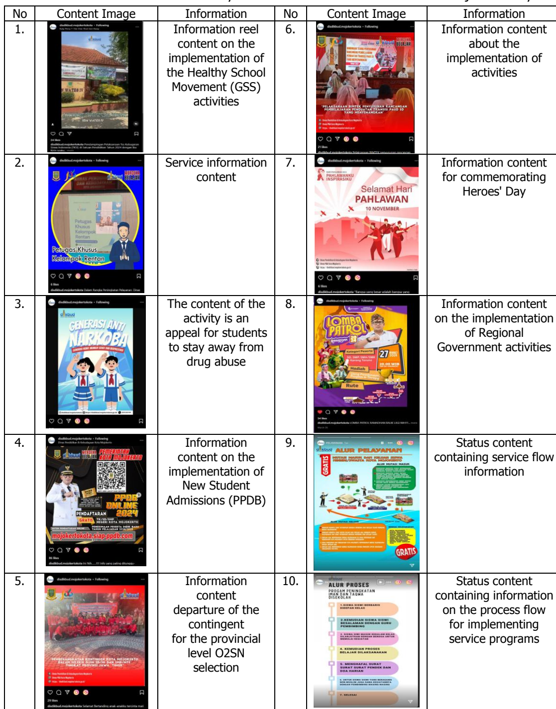
Table 1. Information Presented by the Education and Culture Office of Mojokerto City